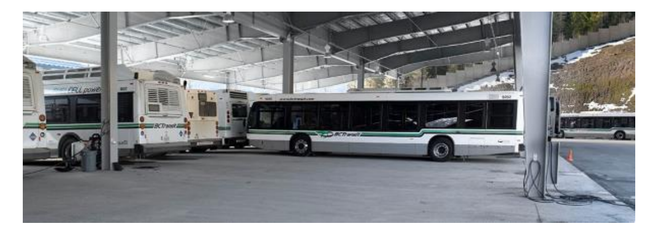
Figure 4: Examples of power outlets at overnight parking

The investment cost for the power outlet at the parking place varies depending on the local circumstances, for example distance between the parking spot and the next power connection. These were around 1,000 \in to 1,500 \in per power outlet. Figure 4 shows examples of power outlets. In this case these are connectors at the pillars which are connected to the buses by wire.