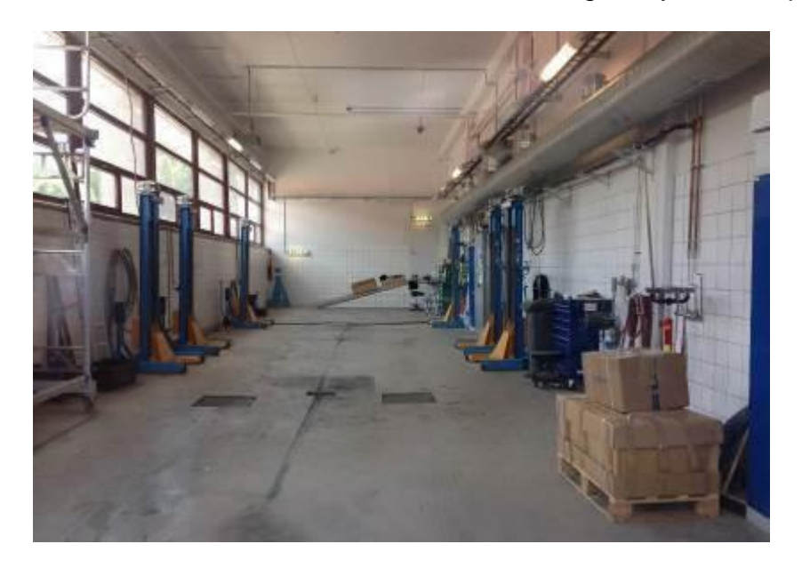
Figure 12: Workshop in Oslo

A former wash hall was converted into a single bay workshop.