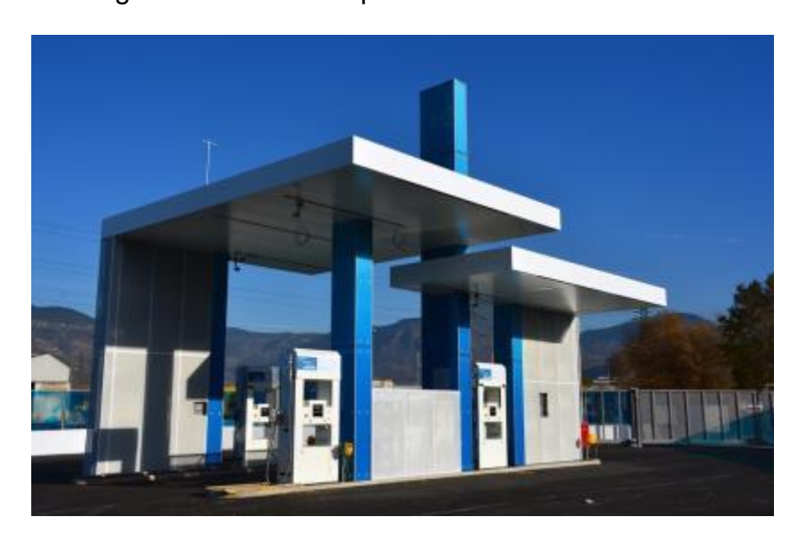
Figure 16: Bolzano filling station

The Bolzano filling station is located at the H_2 center of the Institute for innovative technologies. The location is close to a highway as part of the Brenner axis from Munich to Modena. Figure 16 shows the dispensers, the rest of the station is in a building not visible on the picture.