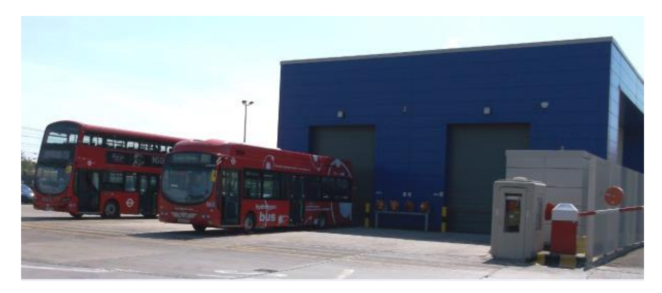
Figure 10: Workshop in London

A new facility was built with two maintenance bays.