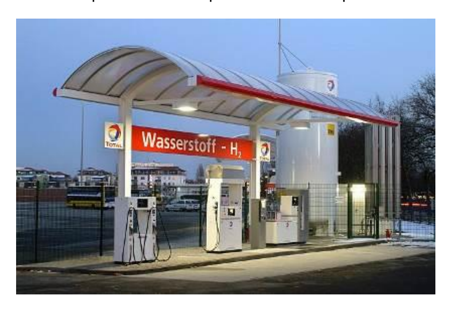
Figure 15: Berlin filling station

The Berlin station was a partly public filling station, with one part of the station inside the bus depot and another part outside the depot.