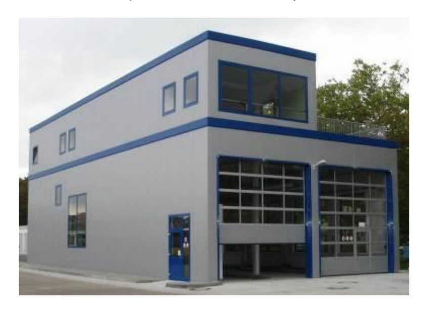
Figure 6: Workshop in Berlin

A new workshop was built with one bay for 12 m buses and one for articulated buses.