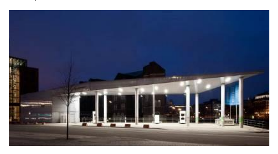
Figure 18: Hamburg filling station

The Hamburg station is a representative public filling station located in the so-called HafenCity which is a central area in Hamburg. Figure 18 shows mainly the filling area. The technical equipment of the station is located in the building at the left end of the picture.