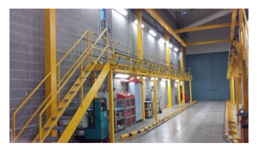
Figure 11: Workshop in Milan

A small area of an existing diesel maintenance depot was converted to suite hydrogen safety demands.