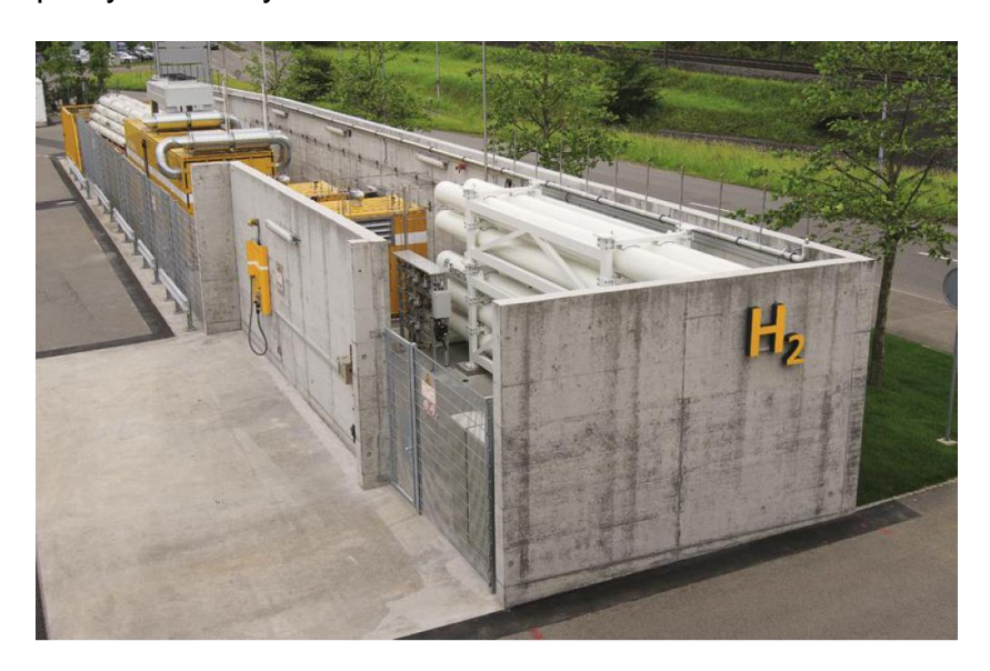
Figure 14: Aargau filling station

Aargau has a filling station at the bus depot without building. The concrete wall is partly for safety reasons.