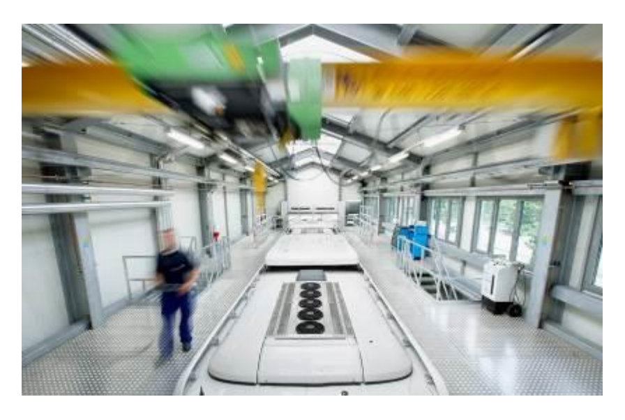
Figure 9: Workshop in Hamburg