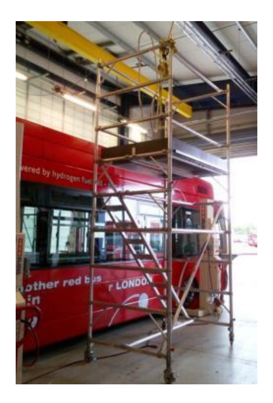
Figure 3: Example of a mobile working platform used in London