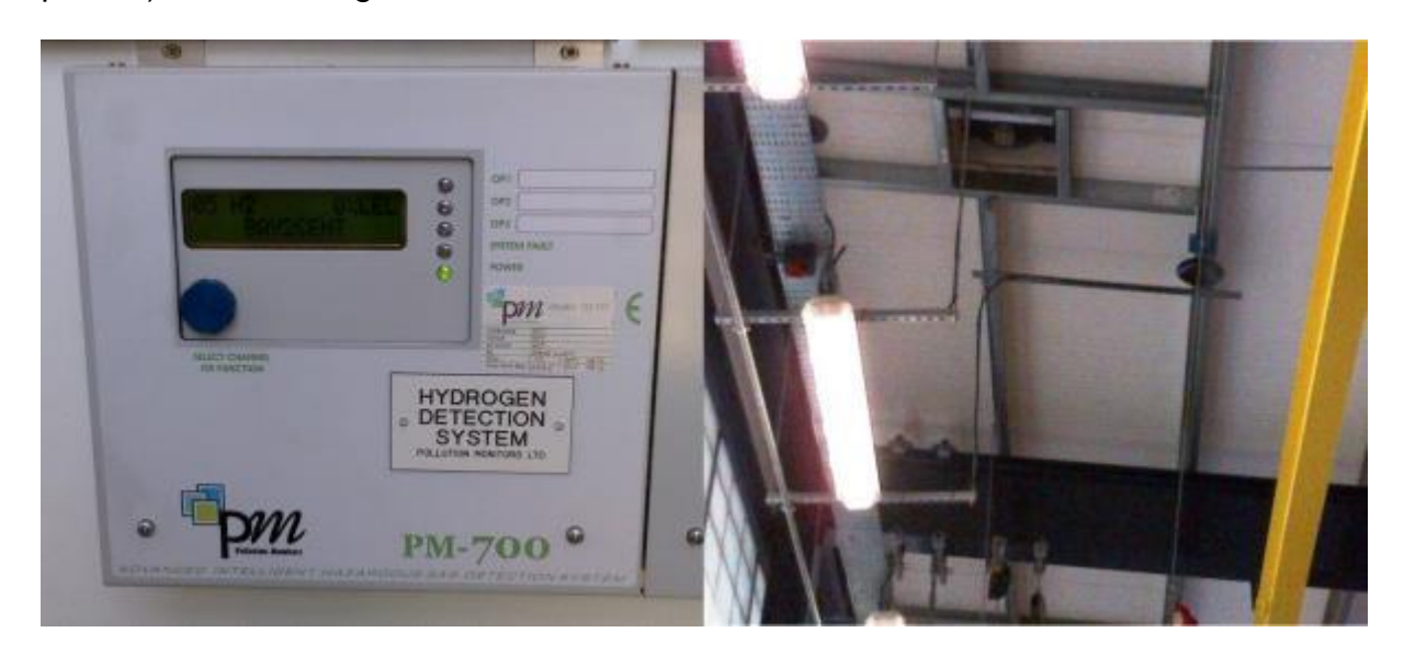
Figure 1: Example of H<sub>2</sub> detection system, H<sub>2</sub> sensors, ventilation and ATEX lights

Figure 1 shows examples of an H_2 detection system with the control panel indicating the H_2 concentration in the left part of the picture. On the right side H_2 sensors (round disc in the middle of the picture), ventilation (fan in the square in the upper part of the picture) and ATEX lights are visible.