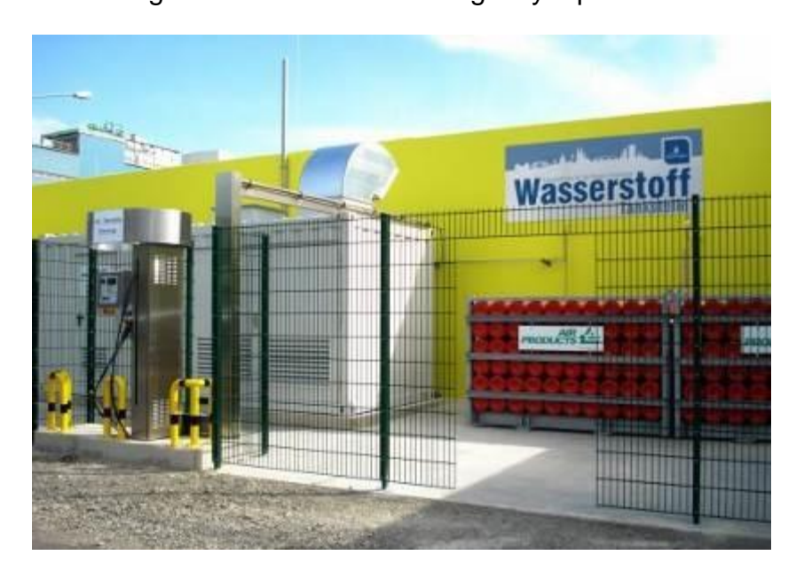
Figure 17: Cologne filling station

The Cologne station has no building only a protective wall and a fence around.