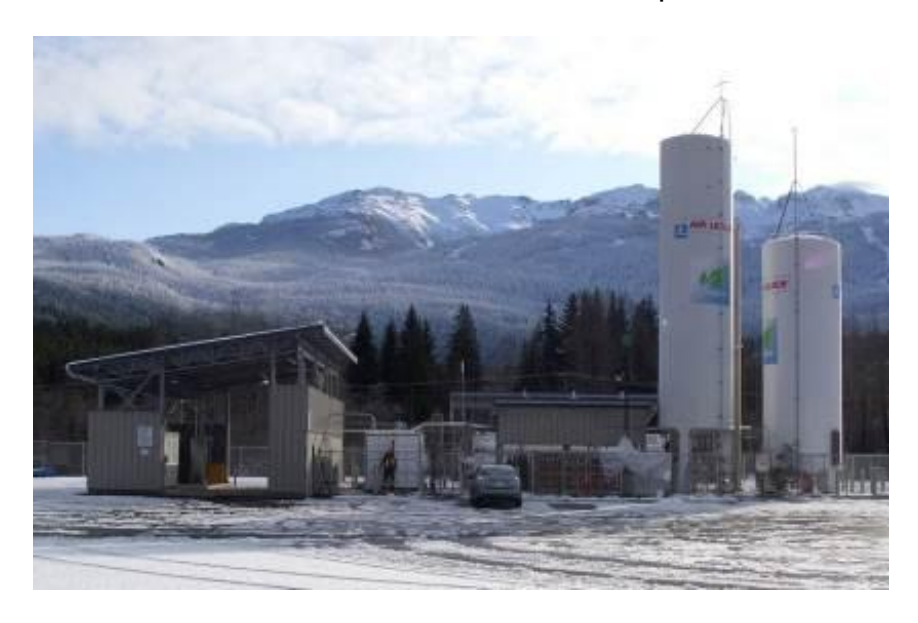
Figure 22: Whistler filling station

The Whistler station is located at the Bus depot, where also the workshop was built.