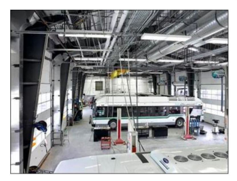
Figure 13: Workshop in Whistler

A new depot was built having six maintenance bays with two vent lines per bay which are hooked up to the H_2 tanks when the buses are brought in for maintenance.