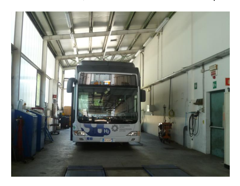
Figure 7: Workshop in Bolzano

An existing paint shop was converted, containing one bay (max two buses in line). The maintenance regarding FC and HV components is done at the suppliers Service Center in Brixen, 40 km of distance from the operator's regular bus depot in Bolzano.