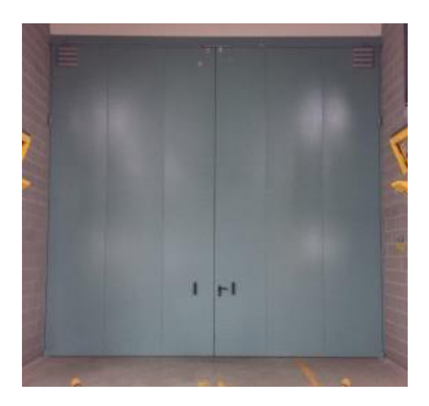
Figure 2: Example of a fire protective door