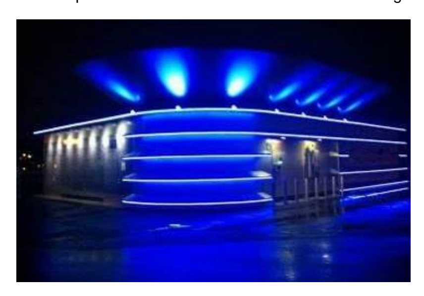
Figure 21: Oslo filling station

The Oslo filling station is at the bus depot, where the FC buses are located and the workshop was built. It has some nice illumination at night as visible on Figure 21.