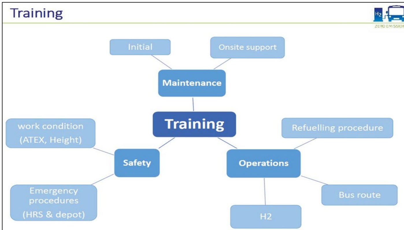
Figure 4-5 Sample 'Mind Map' of Training Requirements.